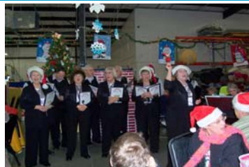
The "Noteables" singing for us