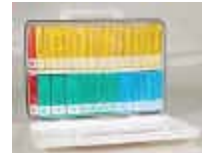
36 Unit Kit $66.60