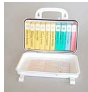
10 Unit Kit $17.58 & Up